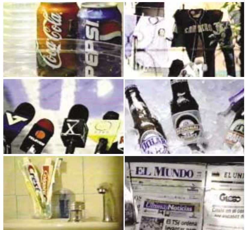
Rival brands like Coca-Cola and Pepsi underline the theme, "We can think differently but live together without violence."