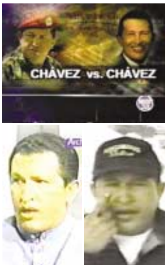
"Chavez vs. Chavez" spots unfavorably contrast the president's promises with his later actions.