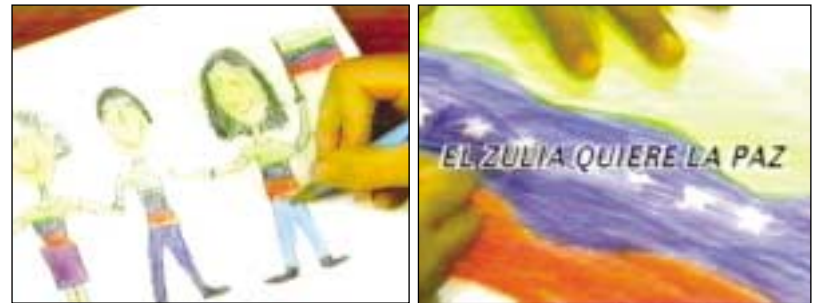
Kids draw flag-waving families asking for peace—and elections now.