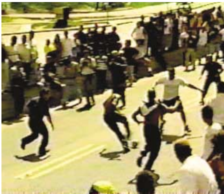
Pro and anti-Chavistas find common ground in soccer.