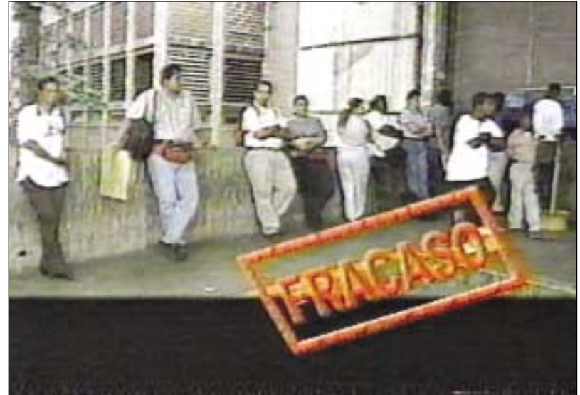
"Failed" is stamped in red over images of Chavez's unfulfilled promises such as ending poverty and unemployment.